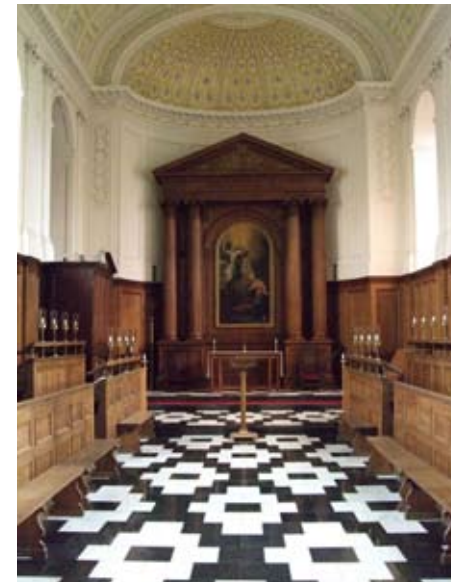
Clare College Chapel