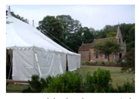
Marquee and church at the 2009 Festival

The Festival will conclude with a service of choral evensong. The Hurstingstone Singers, who have accompanied the singing at the Pilgrimage in 2008 and 2009 will lead