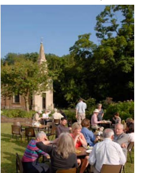
Enjoying supper on the lawn of Ferrar House at the 2009 Festival

one of the participants and as we go to press we are waiting to confirm the second speaker. Check our website www.littlegidding.org.uk/eliotfestival for updated information as it becomes available.