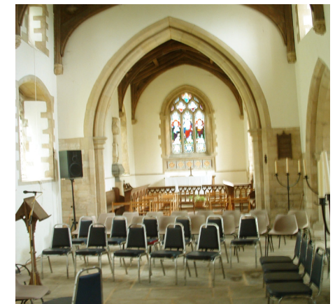
Steeple Gidding Church: the 2007 Festival

Tickets for Sunday are limited as we have to accommodate the members of the Summer School. However, a small number of tickets is available to Friends and others for Sunday's programme. Priority will be given to those who also book tickets for Saturday. Please see the enclosed booking form for further details. We encourage you to book early, as this will not only reduce the risk of disappointment, but also help the organizing committee to sleep a little more easily!