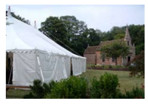
Marquee and church at the 2009 Festival

The Festival will conclude with a service of choral evensong. The Hurstingstone Singers, who have accompanied the singing at the Pilgrimage in 2008 and 2009 will lead