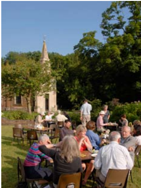
Enjoying supper on the lawn of Ferrar House at the 2009 Festival