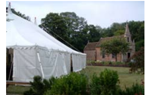
Marquee and church at the 2009 Festival

The Festival is a major literary and musical celebration of the life and work of Nobel Prize winning writer Thomas Stearns Eliot (1888–1965). As in 2009, the 2010 Festival again includes students, lecturers and guests from the T S Eliot International Summer School coming to participate in lectures, discussion and poetry that offer the opportunity for festival-goers to share their interests and enthusiasms amidst the splendid setting of Little Gidding.