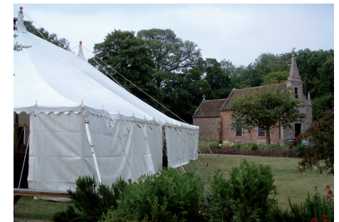
Marquee and church at the 2009 Festival

The Festival is a major literary and musical celebration of the life and work of Nobel Prize winning writer Thomas Stearns Eliot (1888–1965). As in 2009, the 2010 Festival again includes students, lecturers and guests from the T S Eliot International Summer School coming to participate in lectures, discussion and poetry that offer the opportunity for festival-goers to share their interests and enthusiasms amidst the splendid setting of Little Gidding.