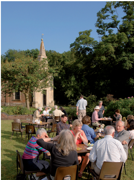
Enjoying supper on the lawn of Ferrar House at the 2009 Festival