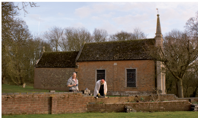
Allan Bell and Canon Bill Girard demolishing the wall at the south-east end of the Ferrar House garden. The wall, which was built in the 1980s or 90s, had become unsafe. The view, now that the wall has been removed, can be seen in the picture on the front page.