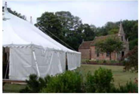
Marquee and church at the 2009 Festival

Interspersed with music, lunch and afternoon tea on the lawns of Ferrar House, the Festival promises to be an inspiring and convivial gathering at the beautiful setting of Little Gidding, which has remained virtually unchanged since T S Eliot visited in 1936 and was compelled to write about it in his 'Four Quartets'.