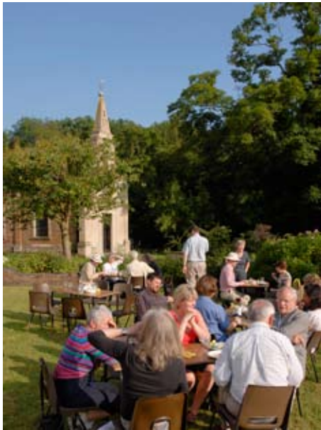
Enjoying supper on the lawn of Ferrar House at the 2009 Festival